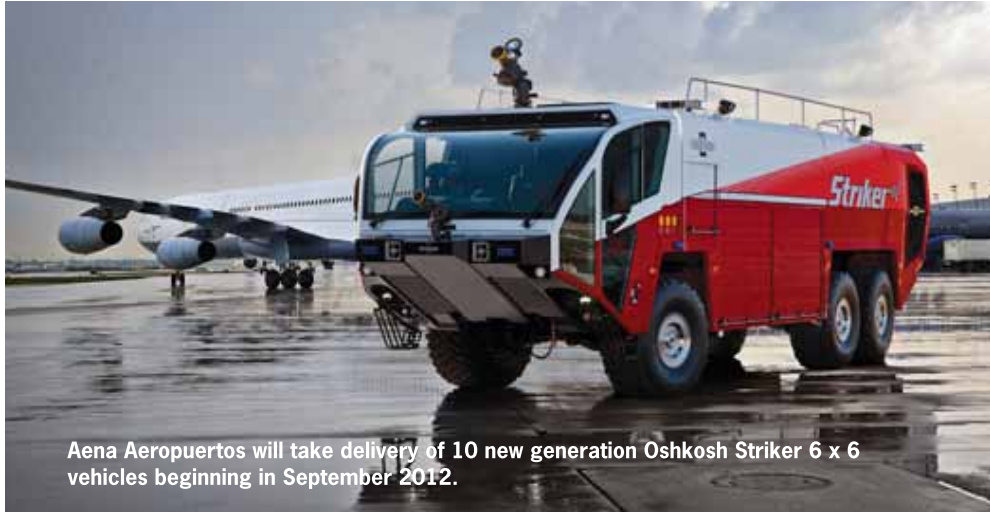
Aena Aeropuertos will take delivery of 10 new generation Oshkosh Striker 6 x 6 vehicles beginning in September 2012.

Oshkosh Airport Products Group announced that it has sold 10 new generation Oshkosh® Striker® aircraft rescue and firefighting (ARFF) vehicles to Aena Aeropuertos of Madrid, Spain. The new Striker 6 x 6 models will be placed into service at Madrid Barajas International as well as other major airports throughout the country. Delivery of the new generation Striker vehicles will begin in September 2012.