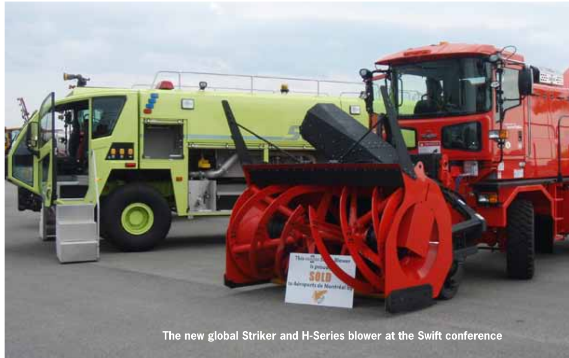
The new global Striker and H-Series blower at the Swift conference

Next, we prepared for the ARFF Working Group Annual Conference in Orlando where we unveiled the newest