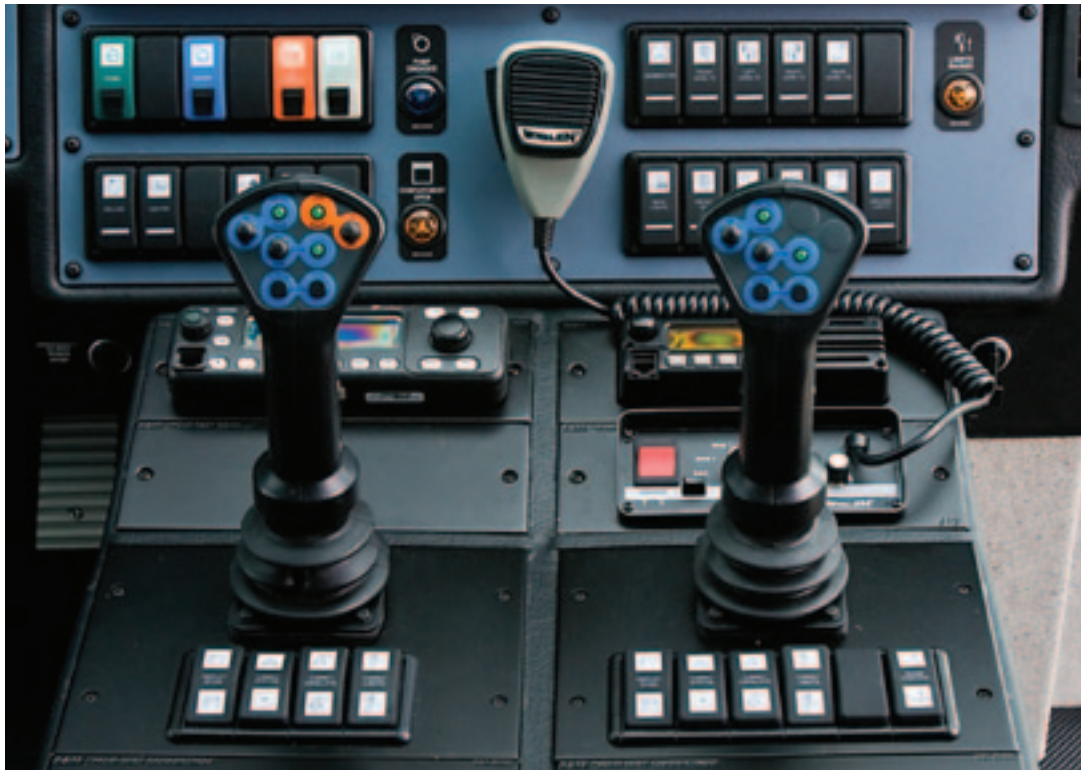
Fire suppression controls and indicator lighting